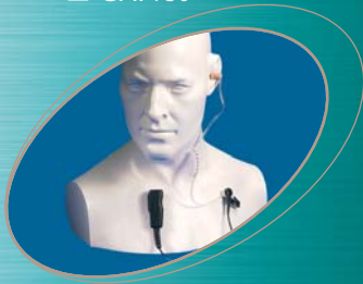
■ EA15/750 ▲ EA15/950