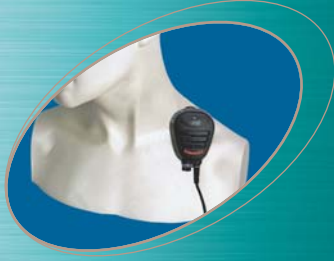
■ CMP750 ▲ CMP950