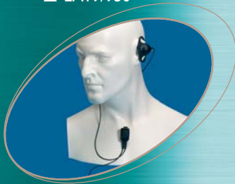
■ EA12/750 ▲ EA12/950