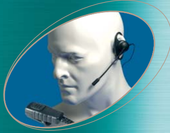
■ EA19/750 ▲ EA19/950