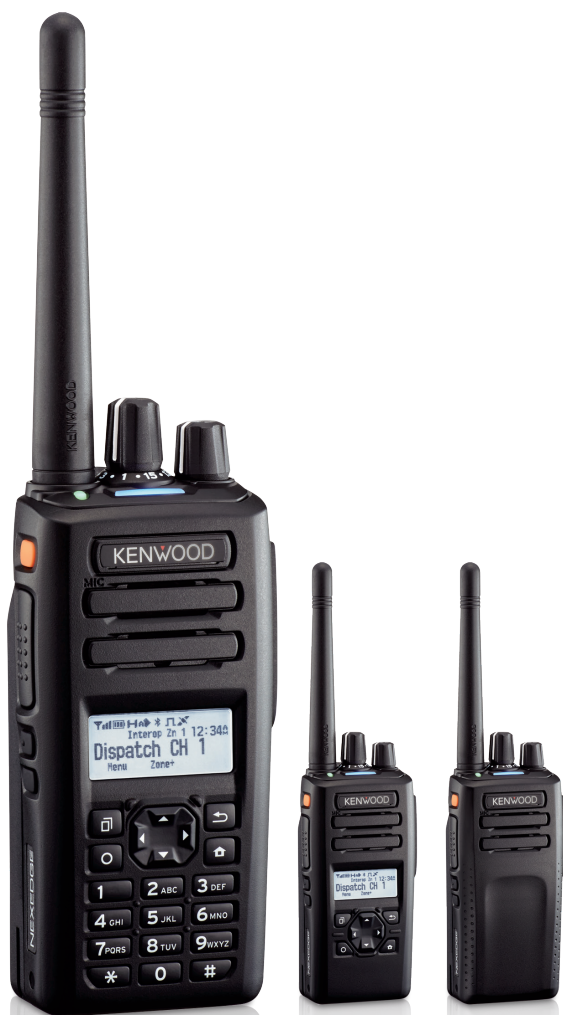
Full Keypad Model

This versatile handheld radio supports both NXDN and DMR digital protocols as well as mixed digital & FM analog operation, enabling it to serve with distinction in a wide range of enterprise- and operation-critical applications. Compact yet designed with durability in mind, it's packed with convenient features like Bluetooth® for hands-free operation and built-in GPS. Three different models are available: Full Keypad model with LCD, Standard Keypad model with LCD and a large 4-way D-pad, and the Basic Model without LCD or keypad. Additionally, for expansion capability a software license certification system facilitates extensive customization.